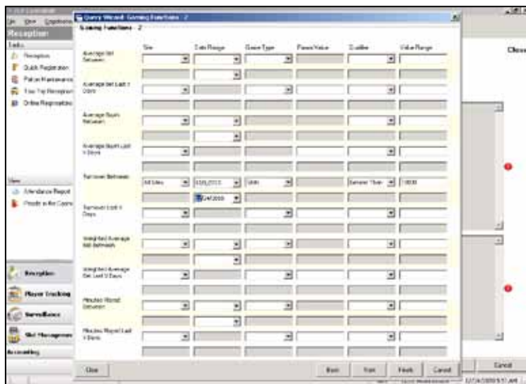
Create targeted promotions that increase loyalty.